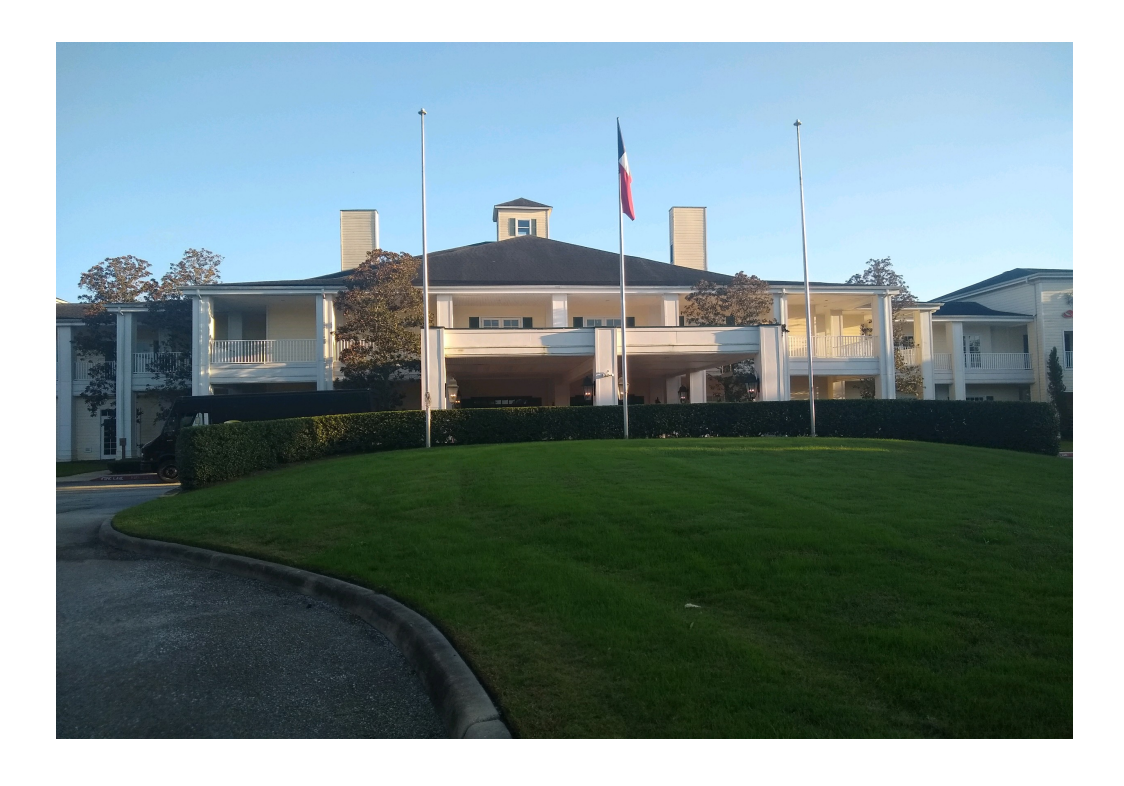
Table Top 2022 – It's Going to be Spectacular – April 21, 2022 Augusta Pines Golf Club.

Thursday, April 21, 2022 Augusta Pines Golf Club 18 Augusta Pines Drive Spring, Texas 77389 5:00 – 9:00 p.m. $ 60.00 per ticket