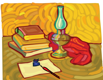
Promoting excellence through education

“The Scholarship Committee has been meeting to discuss the number of scholarships to be awarded, as well as the amount of each, and the criteria for each scholarship.”