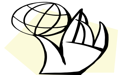
Advertise with SAFD