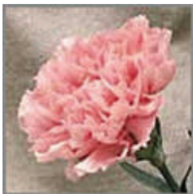
The special language of carnations

I was intrigued about the "traditional" meanings of flowers, and while researching the subject, I was surprised that carnations, which we all use in our designs, have so many meanings, depending on their color.