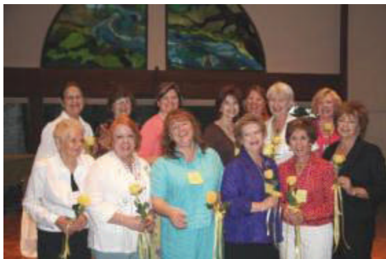
SAFD Board 2008-2009