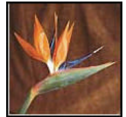
“Burping a bird of paradise”